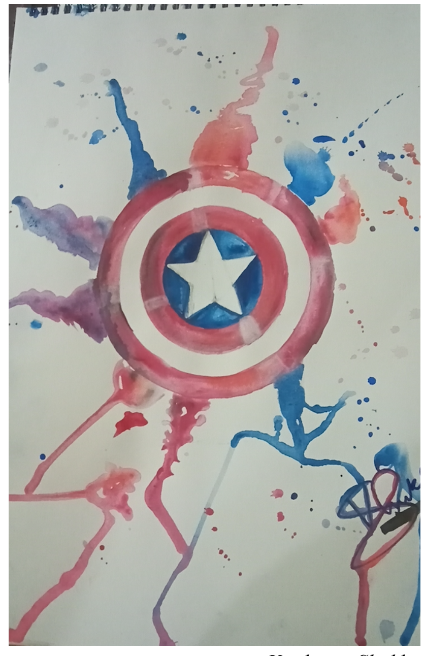
~ Vaishnavi Shukla